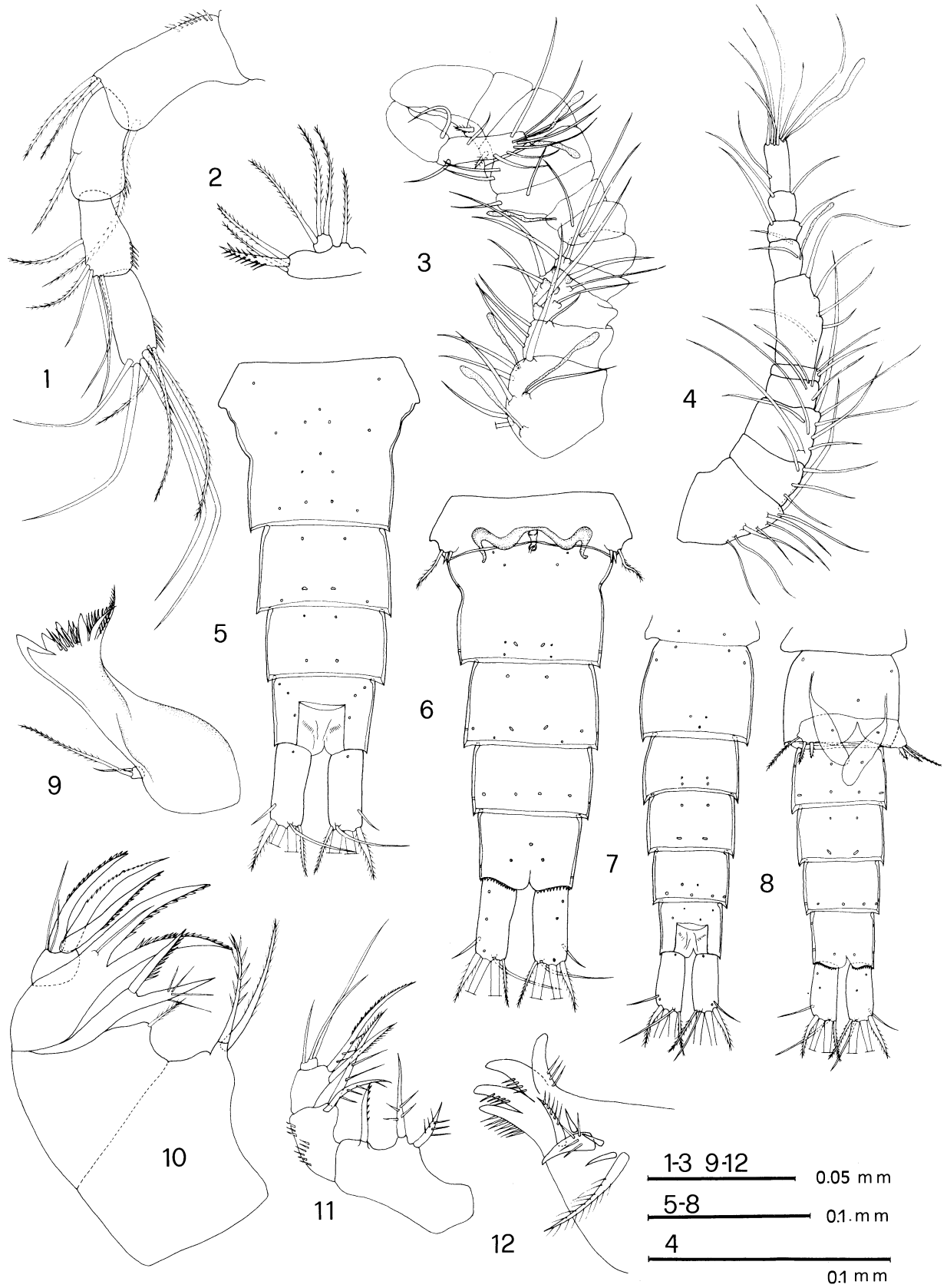
Figs. 1-12. Neocyclops (Neocyclops) petkovskii n.sp. (holotype: 2, 4-6, 10, 12) (allotype: 3, 7, 8) (paratype: 1, 9, 11): 1, antenna; 2, maxillular palp; 3, antennula; 4, antennula; 5, abdomen and furcal rami (dorsal view); 6, abdomen and furcal rami (ventral view); 7, abdomen and furcal rami (dorsal view), 8, abdomen and furcal rami (ventral view); 9, mandible; 10, maxilla; 11, maxilliped; 12, maxillular praecoxa, inner.